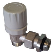
Angle Radiator Valve