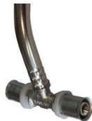
Press Radiator Tee Connector NP