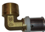
Press 90° Male Elbow