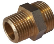
Press Male Screw Fitting Tapered