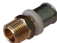
Press Male Coupling