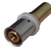
Press Straight Coupling + Insert