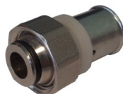
Press Fitting For Multilayer Pipe