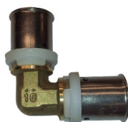
Press 90° Elbow