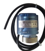
Manifold Electrothermic Actuator 230V