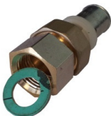
Press Female Screw Fitting Flat Seal