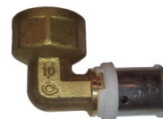
Press 90° Female Elbow