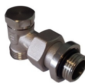
Angle Lockshield Regulating Valve