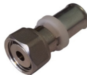
Press Connection Screw Fitting NP