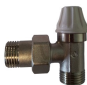
Angle Lockshield Valve

Angle radiator valve with thermostatic or electrical control option, connection 1/2" - inside Ø 16 mm with manual control. Connection for copper and multilayer pipe. 10 bar - 110 °C