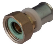
Press Screw Connector Flat Seal