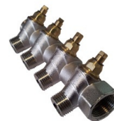
Press Manifold 3/4" M x 3/4" F CW Valve